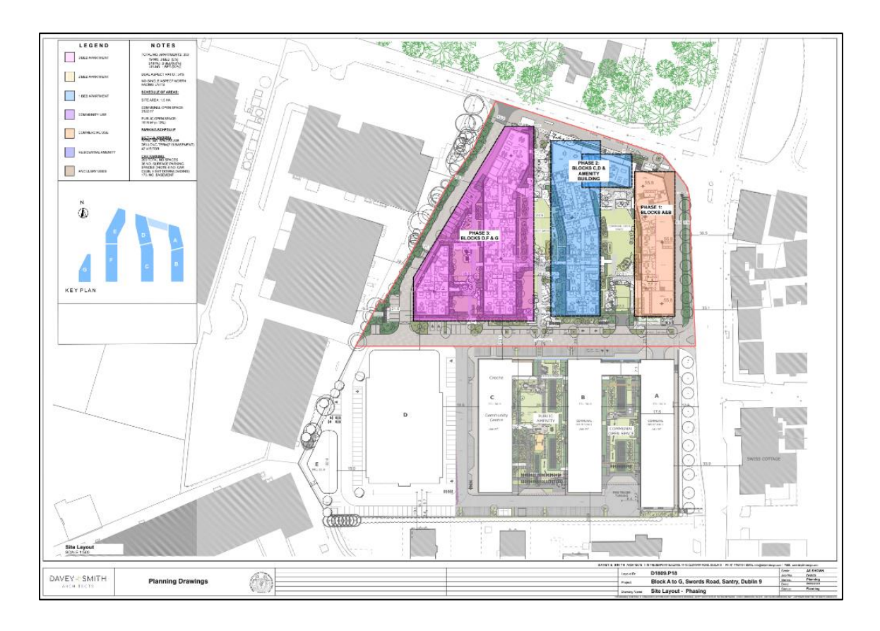
Table 3 - Summary of phasing proposals